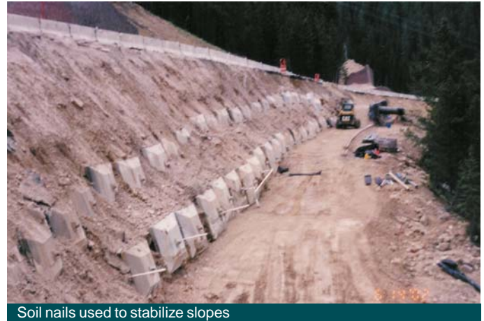
Soil nails used to stabilize slopes