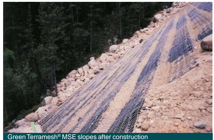
Green Terramesh® MSE slopes after construction