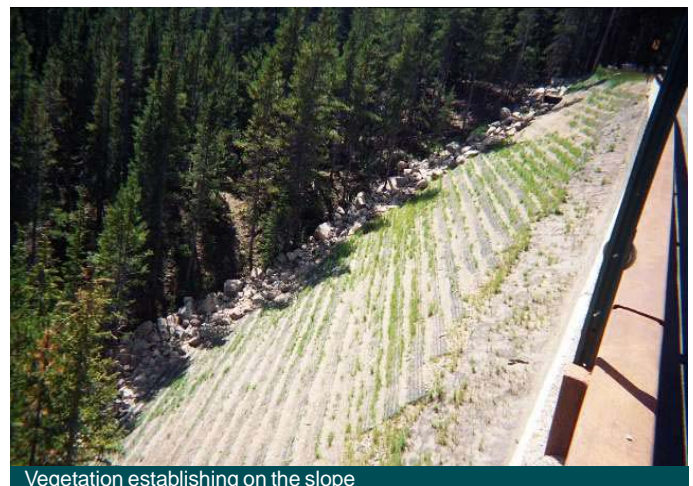
Vegetation establishing on the slope