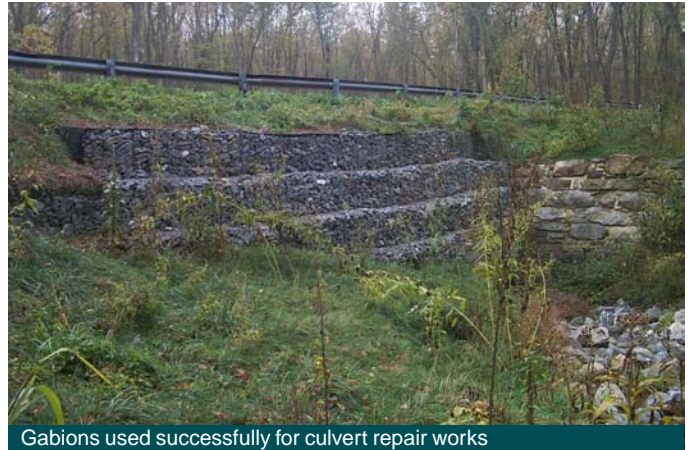
Gabions used successfully for culvert repair works

The historic culvert has been protected for the future enjoyment of visitors to the C & O Canal National Park.