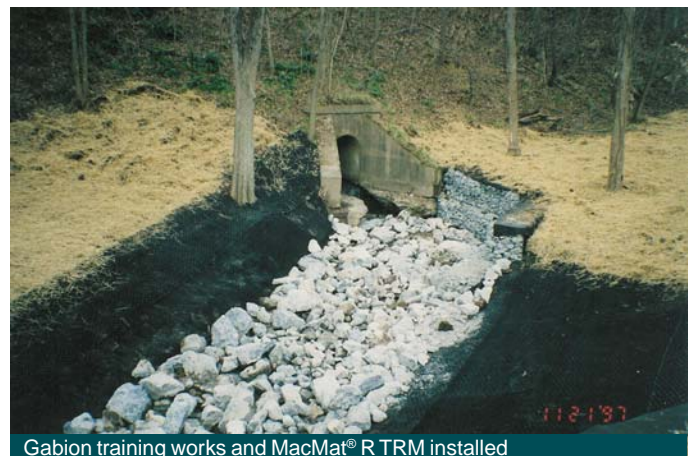
Gabion training works and MacMat® R TRM installed