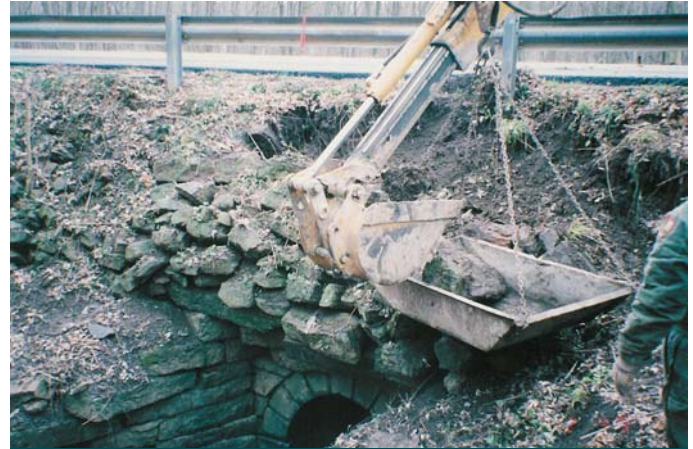
Excavation of existing rubble wall, ready to receive gabions