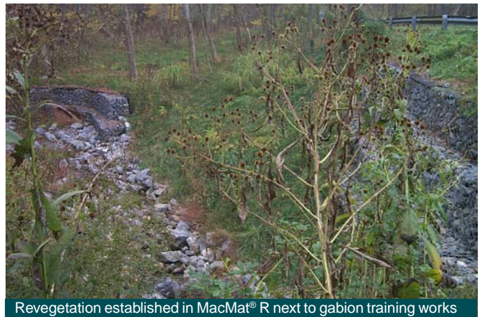
Revegetation established in MacMat® R next to gabion training works