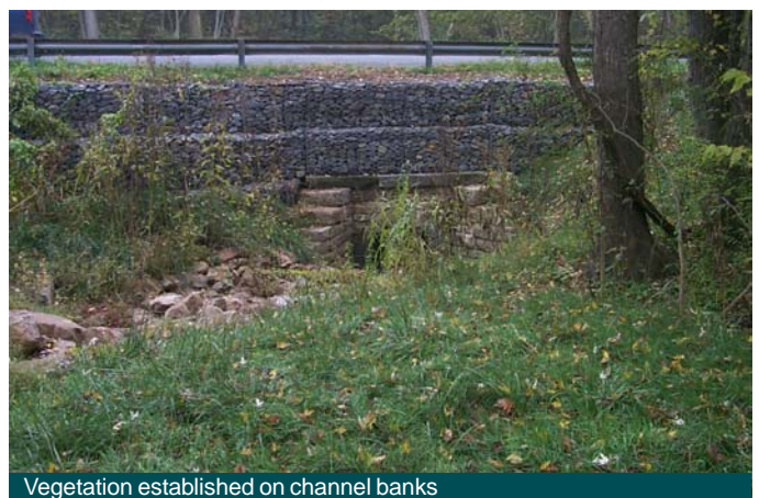
Vegetation established on channel banks