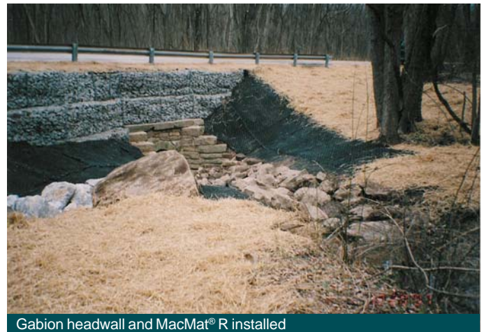
Gabion headwall and MacMat® R installed