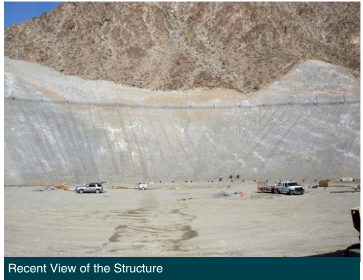
Recent View of the Structure